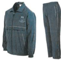
Navy Tracksuit Top Sizes- 24", 26", 28", 30", 32", 34" - £14.00 Navy Tracksuit Bottoms Sizes- 20-22", 22-24", 24-26", 26-28", 28-30" - £10.00

As we are now developing our outside PE lessons, we need to make sure that the children are appropriately dressed throughout the year and particularly in the winter months when it is cooler. We are conscious that some of the children do not have a spare sweatshirt in their PE bags and are wearing their everyday one. We are therefore adding to our uniform list a navy blue track suit or as an alternative a navy blue sweatshirt and navy jogging bottoms. These are available from the One Stop Shop with the school owl logo and will be added to their stock list next week. However, if you would prefer navy sweatshirts and jogging bottoms can be purchased from the main high street shops.