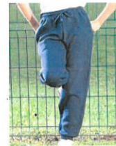
Navy PE Joggers Sizes- 5/6, 7/8, 9/10, 11/12, 13 yrs - £7.50

For the rest of the year, we are happy for there to be a transition period so children will still be allowed to wear their grey jogging bottoms and school sweatshirt but if you need to purchase new, we would ask that you buy the new colours.