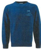
Navy PE Sweatshirt Sizes- 5/6, 7/8, 9/10, 11/12, 13 yrs - £10.45