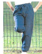
Navy PE Joggers Sizes- 5/6, 7/8, 9/10, 11/12, 13 yrs - £7.50

For the rest of the year, we are happy for there to be a transition period so children will still be allowed to wear their grey jogging bottoms and school sweatshirt but if you need to purchase new, we would ask that you buy the new colours.