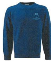
Navy PE Sweatshirt Sizes- 5/6, 7/8, 9/10, 11/12, 13 yrs - £10.45