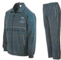
Navy Tracksuit Top Sizes- 24", 26", 28", 30", 32" 34" - £14.00 Navy Tracksuit Bottoms Sizes- 20-22", 22-24", 24-26", 26-28", 28-30" - £10.00

As we are now developing our outside PE lessons, we need to make sure that the children are appropriately dressed throughout the year and particularly in the winter months when it is cooler. We are conscious that some of the children do not have a spare sweatshirt in their PE bags and are wearing their everyday one. We are therefore adding to our uniform list a navy blue track suit or as an alternative a navy blue sweatshirt and navy jogging bottoms. These are available from the One Stop Shop with the school owl logo and will be added to their stock list next week. However, if you would prefer navy sweatshirts and jogging bottoms can be purchased from the main high street shops.