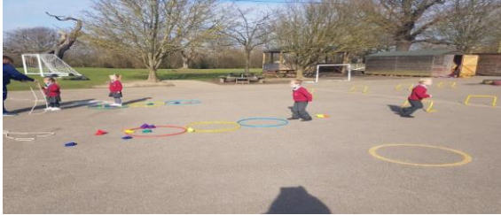
Class J enjoying Jump Start!

As we are coming to the end of the term, please send in sponsor money after the Easter break. Thank you.