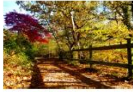
Danbury Country Park