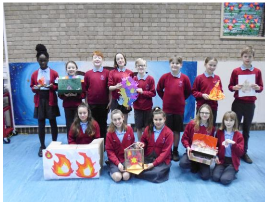
Danbury Park's Year 6