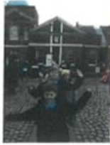
Class Cuckoo's trip to the Royal Observatory Greenwich

On Monday 20th January 2020 Class Cuckoo went to the Royal Observatory in Greenwich.