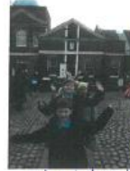
Class Cuckoo's trip to the Royal Observatory Greenwich

On Monday 20th January 2020, class cuckoo went to The Royal observatory in London, Greenwich. We travelled by coach and chose this as our school trip because we are studying Space.