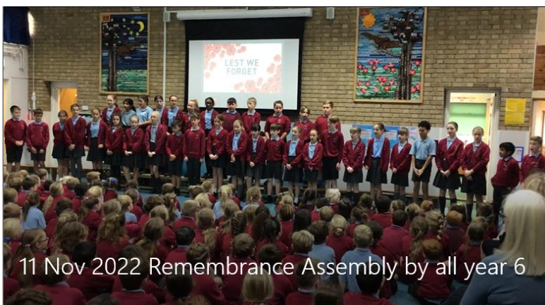
11 Nov 2022 Remembrance Assembly by all year 6

On Friday 11 th November our Year 6 pupils led a special assembly for the whole school to explain to us about the significance of the poppy and why it is so important that at this time of year we remember everyone who fought in wars and supported the efforts to protect the freedom of so many. They recited In Flanders Field and led us in 2 minutes' silence at 11.00am ending with the Last Post . The children did a wonderful job and they captured perfectly the solemnity of the occasion.